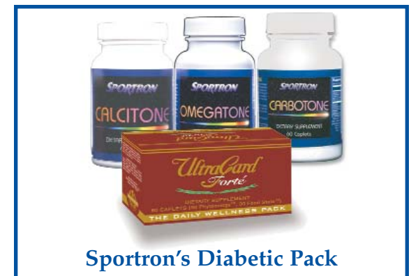
Sportron's Diabetic Pack

Experts all agree that Sportron's Diabetic Pack is the nutritional answer for millions who want to safely and effectively manage Type 2 diabetes.